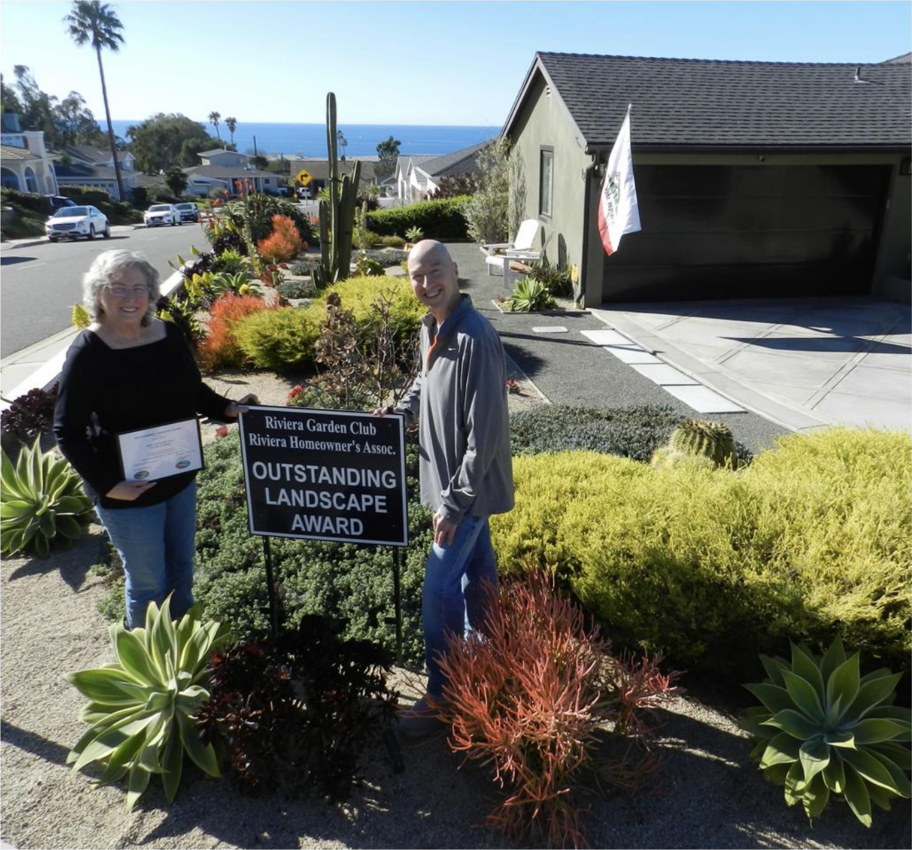
February 2022 – The Gross residence – 125 Calle de Arboles